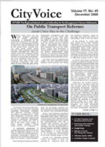
CityVoice Newsletter in English

Website: A major undertaking has been the redesigning and restructuring of the CITYNET webportal, which will display the latest cutting edge advancements of web technology. New features will include a user-login system, forum, animated multi-media elements, and full integration with the communication and programmatic branches at CITYNET.