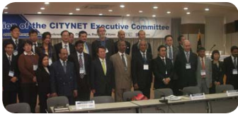
Participants at the end of the 24th Executive Committee in Changwon, Republic of Korea

Indonesia – The CITYNET Indonesia National Chapter, hosted by Sukabumi Municipality, has released "Ten Ways of Achieving the MDGs in Cities in Indonesia" in the Indonesian language which compiles examples of best practices from across the country. The publication serves to promote the objectives of the MDGs and efforts to realise the goals in the near future.