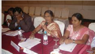
Participants of KLRTC XIII (top) and XIV (bottom)