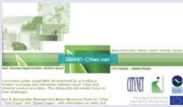
The SMART-Cities Portal project will be reactivated for the year 2009: www.smart-cities.net

Compared to other clusters, the ICT Cluster has faced very little demand. Plans for reactivating the SMART-Cities Project which aims to establish working private-public partnerships between local governments and the private sector are underway for 2009.