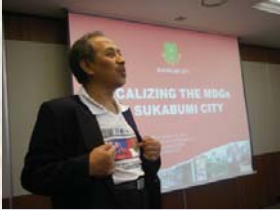
CITYNET Indonesia National Chapter discusses localising the MDGs.

MDGs and Municipal Poverty Reduction Strategy Paper for the Municipalities of Nepal” in Nepali. CITYNET Indonesia Chapter, hosted by Sukabumi Municipality, has likewise published “Ten Ways of Achieving the MDGs in Cities in Indonesia”.