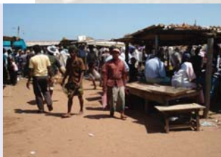
Project site for eco-tank installation in Negombo, Sri Lanka

before discharging the purified contents into the environment. The discharge, in turn, may be used as very fertile soil. The city of Bangkok transferred experiences with eco-tank technology to representatives from Hue, Negombo, and Palembang. Action plans are currently underway to install eco-tanks at proposed pilot sites in low income-community areas in these respective cities.