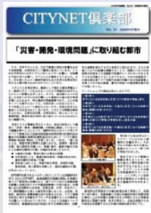
CITYNET Club Newsletter in Japanese