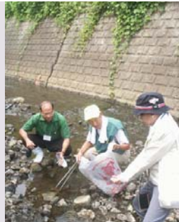
Post-AWAREEE Training in Yokohama, Japan