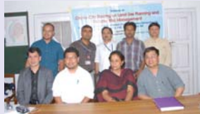
Meeting between Makati City experts and Kathmandu officials

Faced with the challenge to protect vulnerable cities to the risks of disaster, the Disaster Cluster organised Disaster Risk Reduction and Management (DRRM) programmes. In the C2C Cooperation Project between Makati and Kathmandu, Kathmandu was able to integrate DRRM and climate change impacts in its urban planning and management.