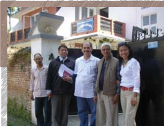
Joint Office inauguration in Kathmandu in March 2007.

MDGs localisation and implementation, poverty reduction, good governance