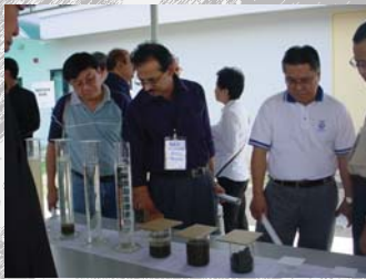
Participants at the KLRTC XI on Integrated Urban Planning.