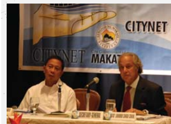
Makati Mayor Hon. Jejomar C. Binay (left) and the CITYNET Secretary-General during the 23 rd Session of the Executive Committee.