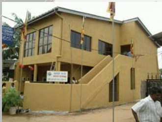
Community Centre inaugurated in Moratuwa, Sri Lanka.