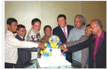
Members cutting a cake during the reception to celebrate the 20 years of the Network.

The most exciting part of the CITYNET story is that it is still unfolding in myriad ways. Cities in Asia are growing rapidly and continue to see the benefits of being part of this intensely active community. Today, the CITYNET dream of a better urban reality has expanded to include members and partners from not just the Asia-Pacific, but from all around the world.