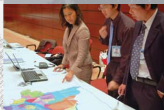
Discussions on the implementation of the Eco Tank in Hue during the International Sanitation Seminar held in Makati in October 2007.

Under the Cluster's action plan, the Eco Tank – a non-electric sewage separation technology – was set to be transferred to Hue, Vietnam, from Bangkok. Exchanges took place on this project during 2006 & 2007, and study visits were conducted to pass on knowledge for several locations in Hue to install Eco Tanks. Hue is also planning to launch an environment-friendly boat to sensitise its floating boat communities to environmental issues. Cluster member Banda Aceh continued to draw on Yokohama's expertise in waterworks under the three-year project the two cities are engaged in, while the annual training programme on waterworks hosted by Yokohama saw participation from various cities.