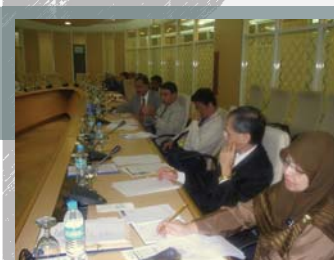
Participants at the Infra Cluster Meeting held in Kuala Lumpur on June 2007.

Urban transport, traffic management, land-use planning