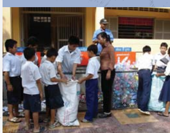
Garbage separation at a public school in Phnom Penh as part of the AWAREE Project.