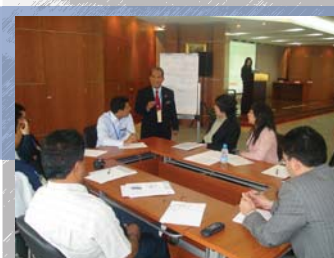
Group session during a CIFAL Shanghai training on March 2007.

Promotion of ICT-enabled municipal services, reduction of North-South digital divide