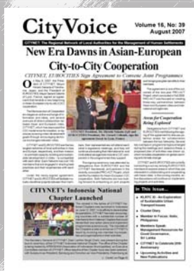
CityVoice - August 2007 Issue

Website: The CITYNET webportal, redesigned in 2006, has worked well in generating awareness and interest about CITYNET. It houses tools for members and visitors to find project partners based on their priorities.