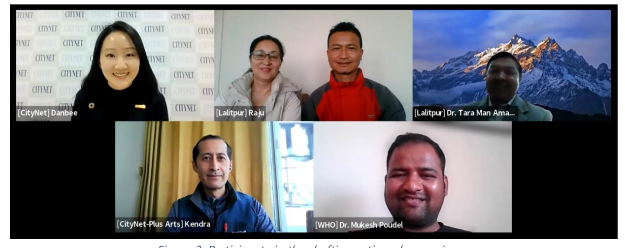
Figure 2. Participants in the drafting action plan session